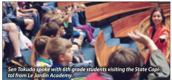
Sen Tokuda spoke with 6th grade students visiting the State Capitol from Le Jardin Academy.

After two years of task force meetings with state, county and provider participation, and knowing that clean and sober homes have raised serious concerns in our community for years, the Legislature passed HB2224 this session. HB2224 establishes a voluntary registry within the Department of Health for clean and sober homes and amends county zoning statute to better align functions of state and county jurisdictions with federal law. The bill sets minimum standards for the way the houses are operated and provides a framework for monitoring. The Department of Health will maintain a public website with the listing of homes on the registry as well as take calls about complaints. The Department will also have the authority to revoke the certificate of registration. The Legislature appropriated $250,000 to the Department of Health to implement this registry of group homes.