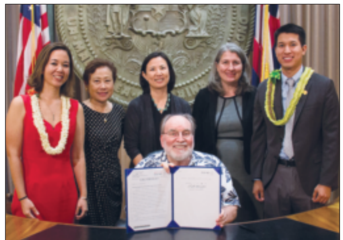
Sen Tokuda introduced and passed SB2768 making kindergarten mandatory for all 5 year olds as a part of the foundation for Hawaii's publicly funded early learning system.

Introduced by Sen Tokuda in an effort to revitalize the Council, the bill amends its leadership as was requested by community advocates and requires the Council to hold quarterly meetings on the status of the Kaneohe Bay Master Plan. A report on any updates and needed statutory changes to maximize the relevance and operation of the Council is due to the Legislature prior to the next session.