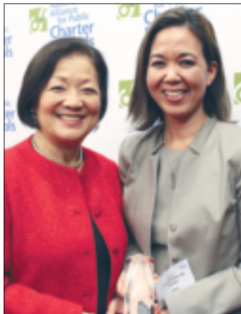
US Senator Mazie Hirono with Sen Tokuda in Washington DC receiving her award from the National Alliance for Public Charter Schools.

Senator Tokuda was one of seven lawmakers throughout the country chosen by the National Alliance for Public Charter Schools as a 2014 "Champion for Charters." Senator Tokuda was part of a group of federal, state and local elected officials including U.S. Senator Mark Kirk, U.S. Representative George Miller, and New York Governor Andrew Cuomo, honored at a ceremony in May at the US Capitol in Washington DC for working to advance the growth and success of high quality public charter schools. Senator Tokuda was chosen for this award for chairing a task force on charter school governance and accountability that resulted in the complete recodification of Hawaii's charter school laws. These changes balanced accountability with autonomy, allowing for that innovation charter schools need to be creative, and it also increased Hawaii's national ranking among all states from 35th in 2012 to 14th in 2013.