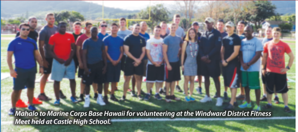
Mahalo to Marine Corps Base Hawaii for volunteering at the Windward District Fitness Meet held at Castle High School.